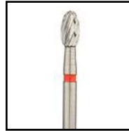
BUR carbide, Egg/Football 7404, H379.31.014 5 per pack Product #: GD05200