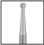
BUR carbide, Round 4 FG, H1.31.014 5 per pack Product #: GD04400

Looking for a great deal on dental supplies? Check out the products below available in the U Market Stock catalog. Just copy and paste the "Product #" into the U Market search bar to find the item and add it to your cart!