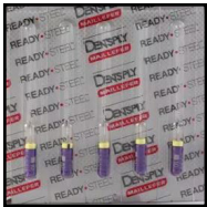
Root Canal Ready Steel Flexofile, 10, 25mm 6 per pack Product #: GD22650