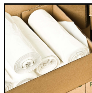
Envision 1-ply Facial tissue 1 box Product #: CX40990