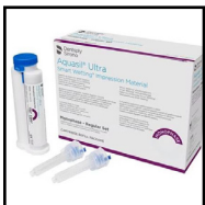
Impression Material, Aquasil, Monophase, Regular Set 4 per pack Product #: GD12856