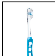
Oral-B Imprint Toothbrush, 35 soft 12 per box Product #: GD19927