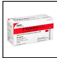
Anesthetic xylocaine, 2% w/ epi, 1:100,000 inj, 1.7ml 50 per box Product #: GD13263