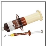
Tissue Management Kit 1 kit Product #: GD26787