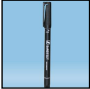
Fine Tip Waterproof Lab Pen 1 pen Product #: CX13336