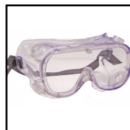
Safety Goggles, for Chemical Use 1 pair Product #: GH62247