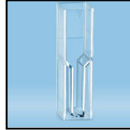
Semi-Micro Cuvette, 3 ml 1 per box Product #: CX11428