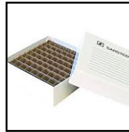
Storage Box for 100 Collection Tubes 1 box Product #: CX18055