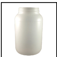
Plastic Jug, 1 Gallon, Lid Sold Separately 1 jug Product #: CX12760