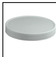
Plastic Lid (for CX12760) 1 lid Product #: cx12761