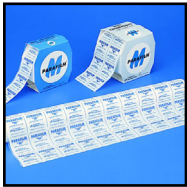
Parafilm, 4"X124', 0.127mm thickness 1 roll Product #: CX13300