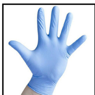
Nitrile, Textured, Blue Powder-Free, Exam Gloves 100 per box

SIZES: Small - CX40946 Medium - CX40947 Large - CX40948 X-Large - CX40949