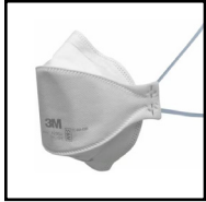
3M AURA N95 Particulate Respirator Mask 1 mask Product #: CX40398

Looking for a great deal on medical supplies? Check out the products below available in the U Market Stock catalog. Just copy and paste the "Product #" into the U Market search bar to find the item and add it to your cart!