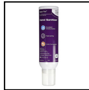
Alcare Plus Foaming Hand Sanitizer, 9oz 1 bottle Product #: MS00019