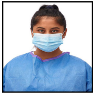
Disposable, Level 1, Blue Mask 50 per box Product #: CX40602