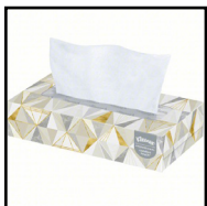
Kleenex Facial Tissue 1 box Product #: CX40988