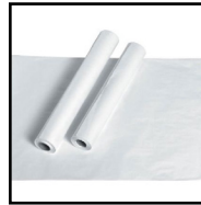
Exam Table Paper, Crepe, 18"X125', White 1 roll Product #: CX42300