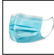
Disposable, Level 3, Blue Mask 50 per box Product #: CX40529