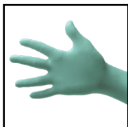
Neoprene, Powder-Free, Green Exam Gloves 100 per box

SIZES: Small - CX40946 Medium - CX40947 Large - CX40948 X-Large - CX40949