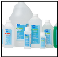
Isopropyl alcohol, 70%, 16oz 1 bottle Product #: CX20535